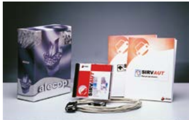
Classroom management and student evaluation via SIRVAUT software integrated in the equipment.