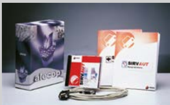
SIRVAUT software integrated in the equipment.

This manual contains explanations regarding the workings of different circuits, diagrams of basic principles, real related reference diagrams, fuse characteristic, relays, lamps and electrical boxes, standards regarding light installation, operating standards for the equipment, characteristics, maintenance, etc.