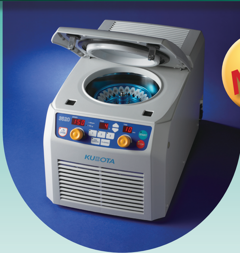
Table Top Micro Refrigerated Centrifuge